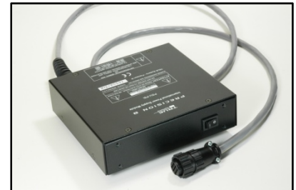
PSU-P8i Power Supply